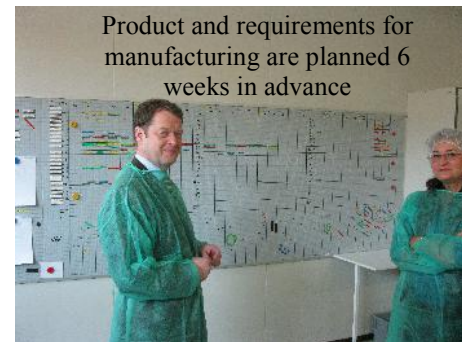
Product and requirements for manufacturing are planned 6 weeks in advance