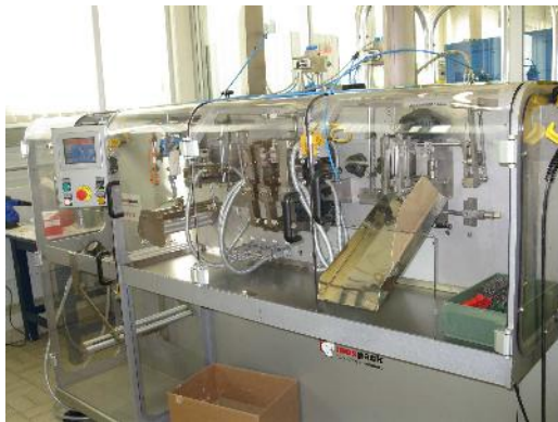
Product:- Will be bottled, boxed with instructions for retail sale and delivery