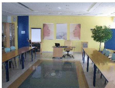
Just 1 of the training rooms