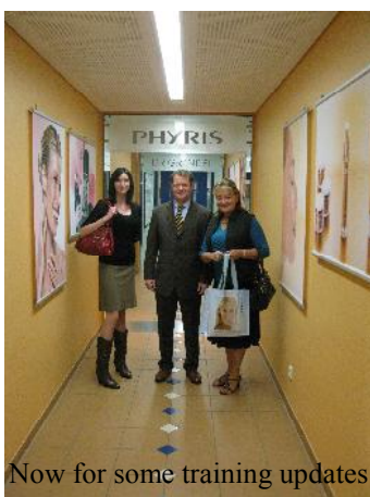
Now for some training updates