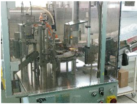
Filling 'New Generation' Ampoules