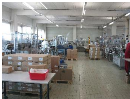
Product:- complete, ready, waiting for storage and delivery