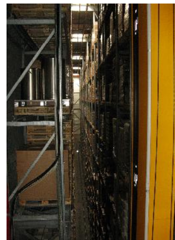
Products stored in a fully automated, constant temperature warehouse.