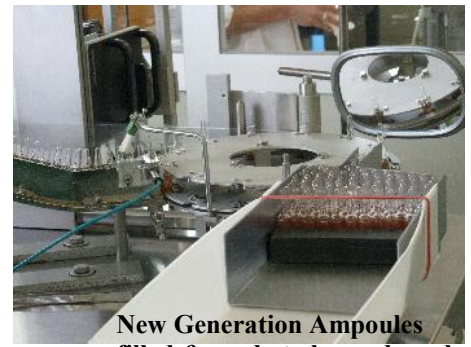
New Generation Ampoules filled & ready to be packaged