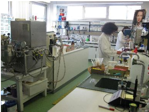
One of the research laboratories testing future products... where it all begins