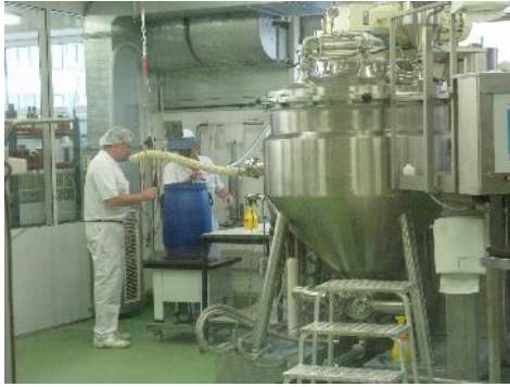
Production and then quality control