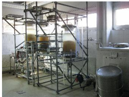
Manufacture of Wheat germ - a proven method, standing the test of time