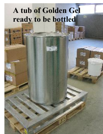
A tub of Golden Gel ready to be bottled