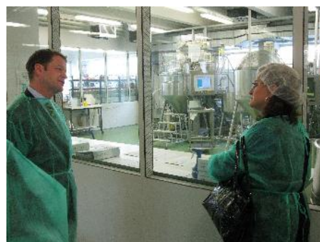
The Phyris 'Kitchen' brewing another batch