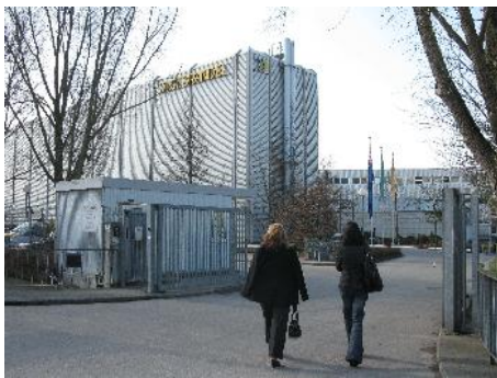
A section of Phyris manufacturing / research plant (note the 'Aussie' Flag)